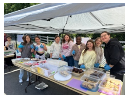
Grade 4/5 Bake Sale Fundraiser