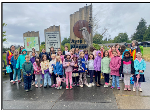
Poirier Choir performance at Ayre Manor!